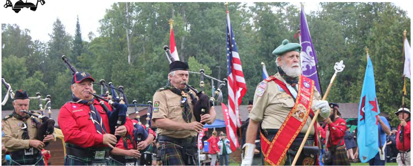
Gilwell Pipe and Drum Corps parading in for the opening of this weekend's 65 th annual Gilwell Reunion